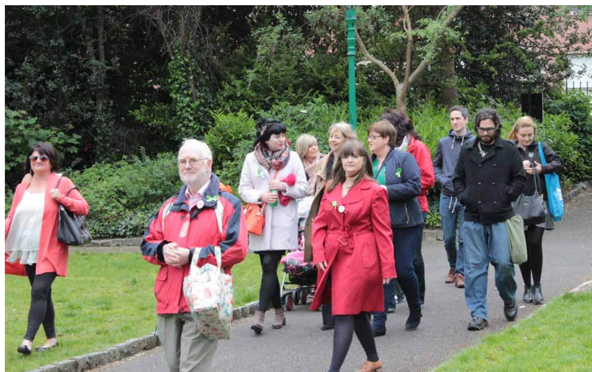
CPsychI Walk and Talk with Psychiatrists which involved REFOCUS members