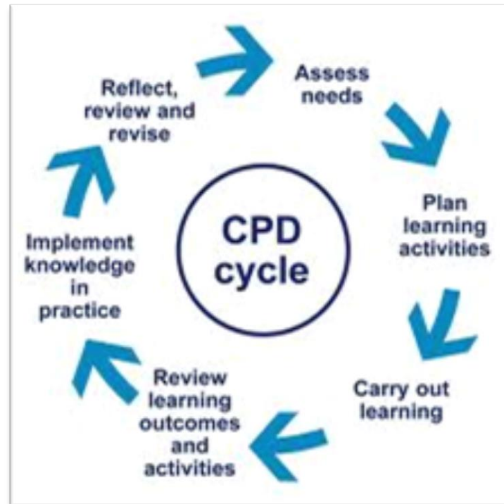
FIG. 2 THE CPD CYCLE